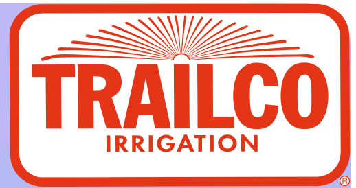
TCS20 Basic Model

Capable of spraying liquid effluent or water over an area 200 metres long by 25 metres wide in one unattended run.