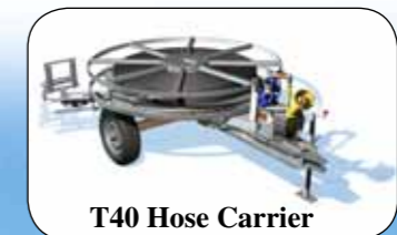
T40 Hose Carrier