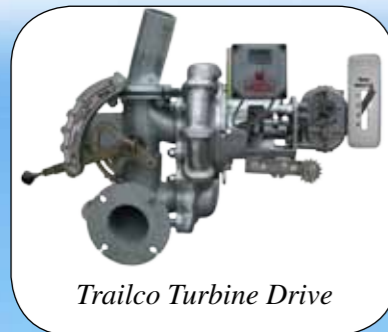
Trailco Turbine Drive

Other Sizes available to match your specifications